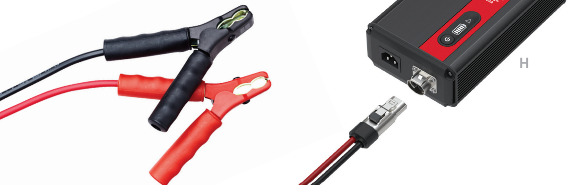
B = Weight, D = Depth, H = Height